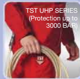
TST UHP SERIES (Protection up to 3000 BAR)