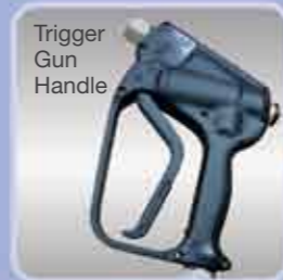
Trigger Gun Handle