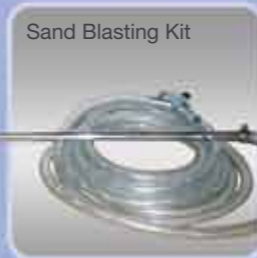
Sand Blasting Kit