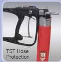
TST Hose Protection